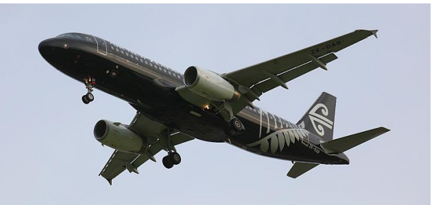
Right , Air New Zealand paints the lead aircraft of a series in a distinctive 'All Black' scheme. This is ZK-OAB, an Airbus A320-232.