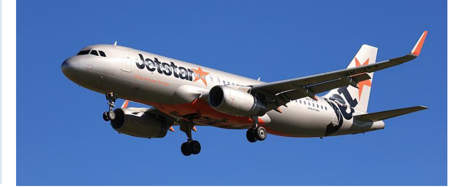
Right, VH-VFX is another of the ubiquitous Airbus A320-232s.