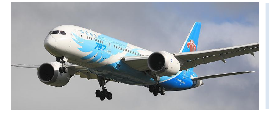
Left and below, another very attractive scheme is Southern China's Boeing 787 Dreamliner. February 2018.