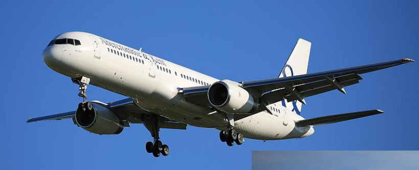
Left and below , an unusual visitor is this pristine and gorgeous Boeing 757 of luxury travel operator Abercrombie and Kent, in these October 2018 shots.