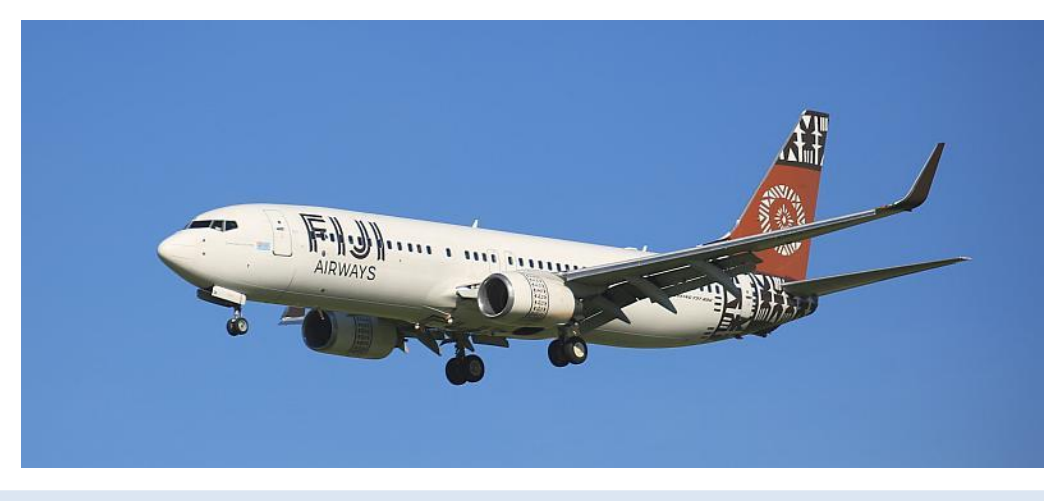
Right , Fiji Airways Boeing 737-800 series DQ-FJM in April 2017.

Below , The mighty Herc! An incredibly lucky shot from December 2016, an LC-130 of the New York Air National Guard, supporting Operation Deep Freeze.