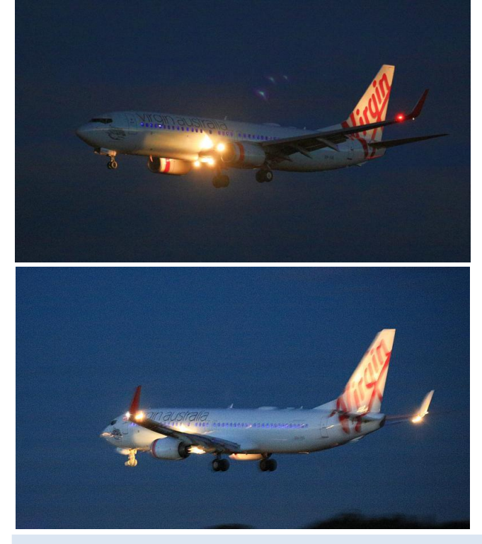
Above and heading photos Virgin on the ridiculous? Virgin Australia Boeing 737-800 arrivals, daylight and dusk; December 2016 and July 2019 respectively.

Some of these are still on my yet-to-capture list.