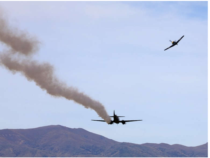
Above, left I was utterly gobsmacked when the Anson started dropping bombs at airshows! The bomb bay doors are springloaded and close immediately after the weapon is dropped. On at least one occasion it dropped a pair of them to bounce across the airfield! Naturally they were inert...